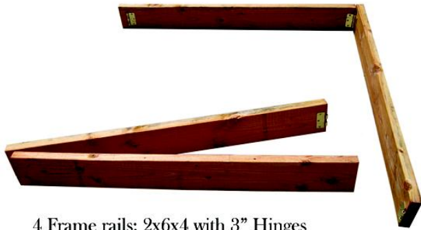
4 Frame rails; 2x6x4 with 3" Hinges - wood treated with linseed oil for longer life.