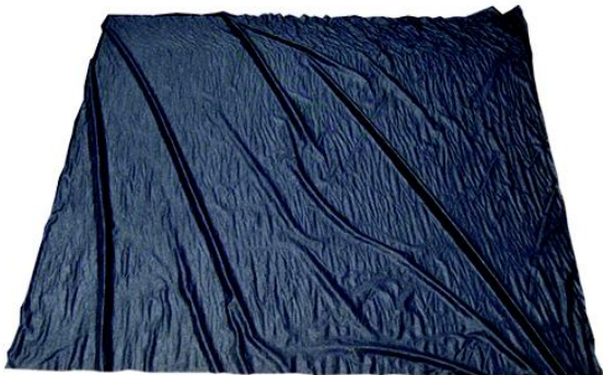
4x4 fabric weed barrier